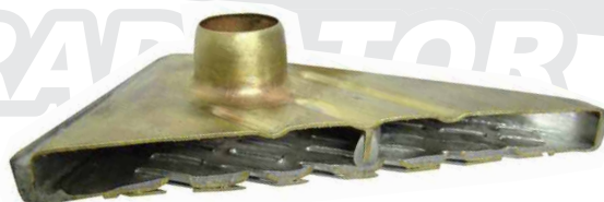
"R" Series Cut A-Way View